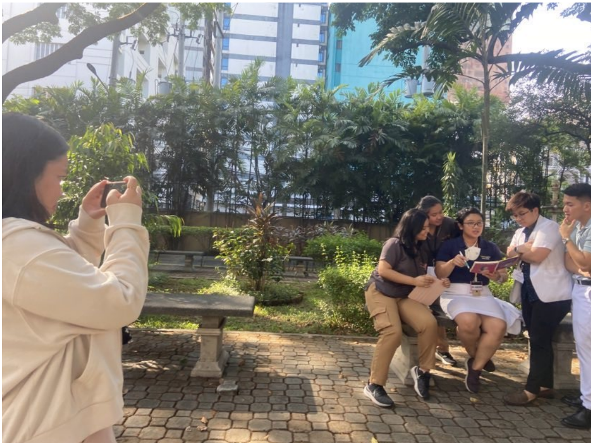
A photovoice activity on 'learning spaces' in the Participatory Action Research workshop