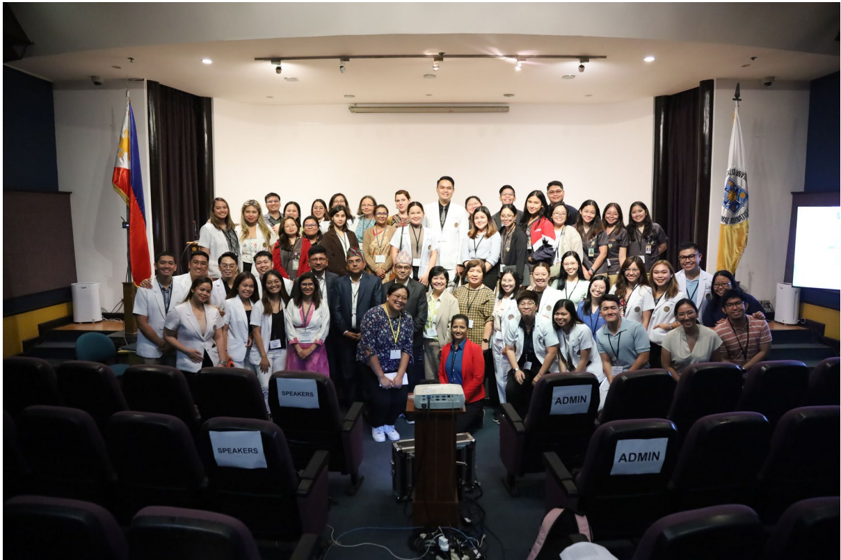
University of Santo Tomas conference participants